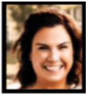
Social Action Coordinator