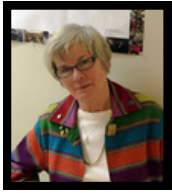
Interim Treasurer Giving is Always Good! Always!

Appalachian District Sisters, Mission: It ALL matters